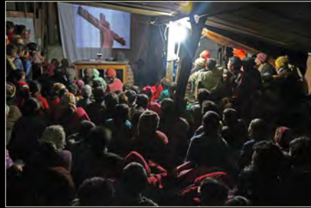
In remote villages worldwide, like this one in Nepal, people who've never heard the Gospel view The HOPE, come to Christ, and a Church is planted.

The strategy to further the worldwide ministry of The HOPE is based on partnering. Hundreds of partners around the world play a vital role in the creation and use of The HOPE. Of all The HOPE adaptations, completed and in process, Mars Hill has initiated less than 15. All the others are the result of those who have come to Mars Hill requesting a version of The HOPE for the people group they are working to reach.