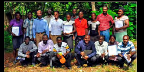
This is just one of many HOPE Study groups led by two lay pastors in Haiti.

The 167-page HOPE Study Guide is now used in 11 languages to disciple people around the world.