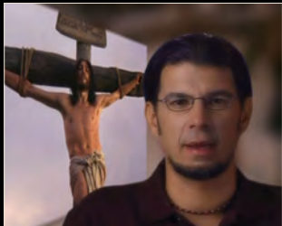
No subtitles here! Storytellers in The HOPE can be exchanged from one language to another.

• Culturally Sensitive - Often cited by missionaries as a model for contextualization, a recent article in the International Orality Network Journal explained how The HOPE merges art, dance and music from various cultures to deliver a Gospel story that is relevant to many people groups.