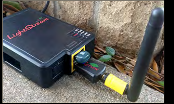
Like something from a science fiction spy movie, missionaries use this unit to covertly share The HOPE.

• Micro Wi-Fi - This little unit can be secretly placed under a table in a marketplace in a security sensitive country. When people in places like this discover a free Wi-Fi signal, they are quick to log on. And if the unit has been placed by one of our partners, people will often find The HOPE, and the Gospel in their heart language.