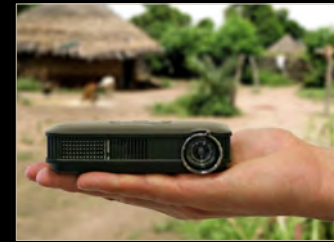
Partners use solar powered projectors like this to show The HOPE.

curriculum built entirely around The HOPE, is being used by missionaries around the world. Another, the Digital Bible Society's "Treasures" project, delivers The HOPE and other evangelistic resources on a variety of digital media, in multiple languages. Over a million Treasures collections have been distributed thus far.