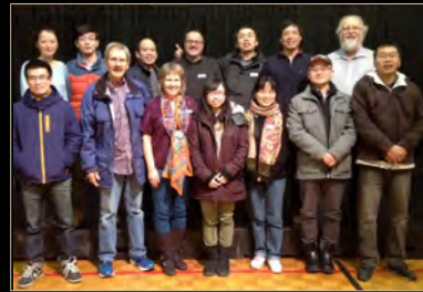
An ESL class in Canada - At the time of this photo, 70 people had come to Christ through this class after using The ESL HOPE.