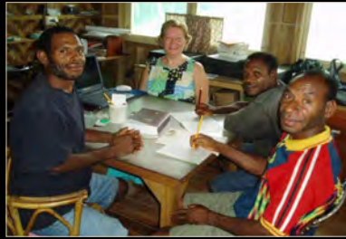
In addition to a translation team like this one in Papua New Guinea, each translation of The HOPE involves a production team and workers in the field who want to use it.

There are now more than 65 translations of The HOPE in use by ministries worldwide, with over 25 new translations currently in production. We've received thousands upon thousands of reported decisions for Christ from those who have viewed The HOPE in their heart language.