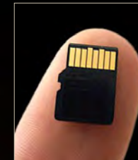
One Micro SD Card can hold several translations of The HOPE.

• Micro SD Cards - One of these tiny media cards can easily hold a HOPE video and a Bible. Inserted and copied into a mobile phone, it is a perfect method for distributing The HOPE to the underground Church in places where it is illegal to have a Bible or a Christian video. It is also an ideal method for sharing The HOPE in the refugee communities of our world.