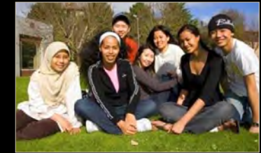
Many International students have come to Christ after viewing The HOPE and return home ready to share their faith.

• Internet - The HOPE video website is available in numerous languages and is visited by hundreds of people a day. Many of these visitors are in the Middle East, and many of them are coming to faith in Christ.